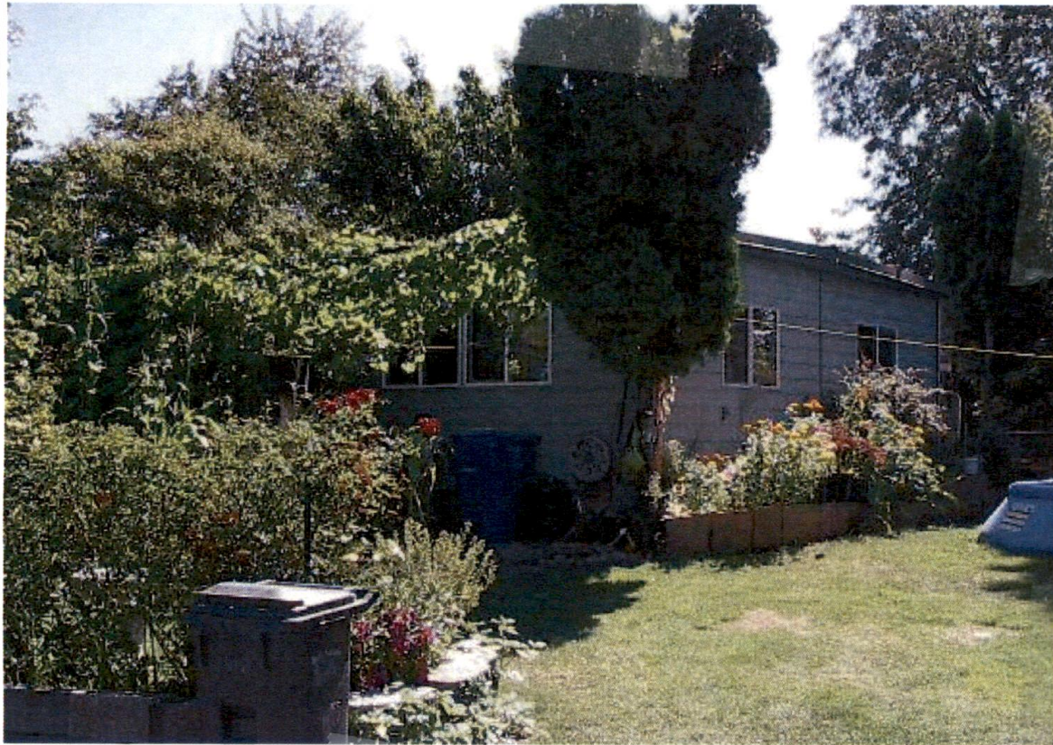
M125583 Chemeketa M.V. 8-24-10