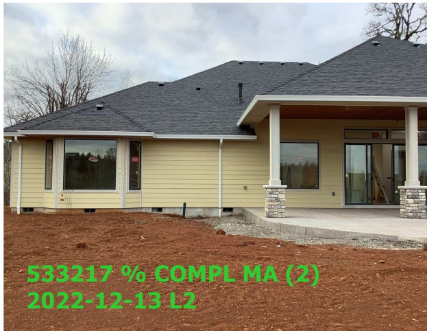
533217 % COMPL MA (2) 2022-12-13 L2