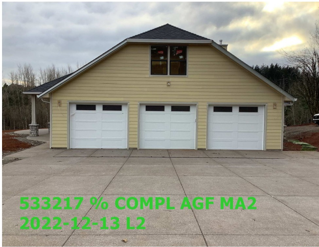
533217 % COMPL AGF MA2 2022-12-13 L2