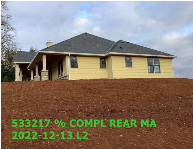
533217 % COMPL REAR MA 2022-12-13 L2