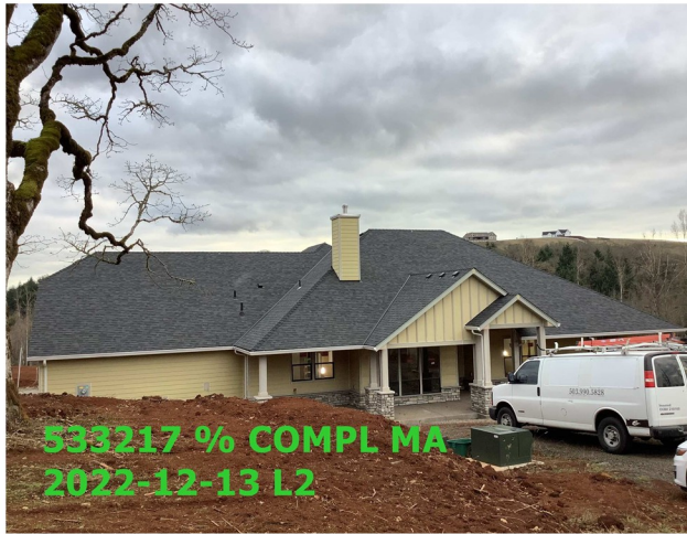
533217 % COMPL MA 2022-12-13 L2