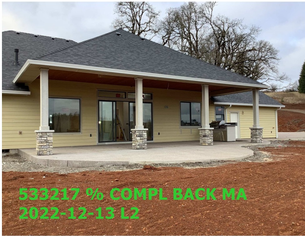
533217 % COMPL BACK MA 2022-12-13 L2