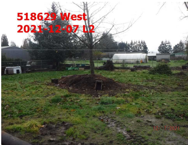
518629 DGU 25X14 West 2021-12-07 L2