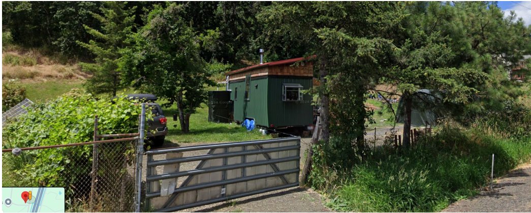
July 24 google drive by

No improvement data available for all other stat class types.