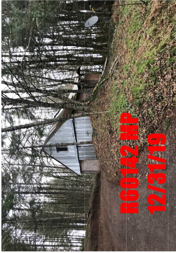
R60142 MP 12/31/19