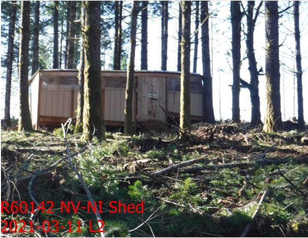
R60142 NV-NI Shed 2021-03-11 L2