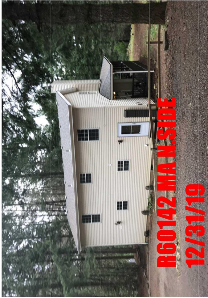
R60142 MA N. SIDE 12/31/19