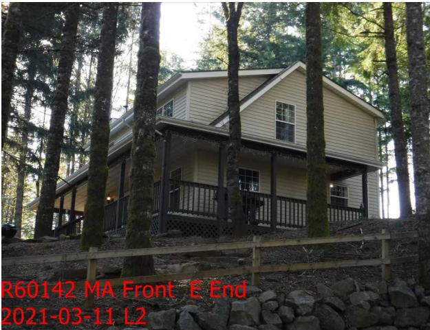
R60142 MA Front E End 2021-03-11 L2