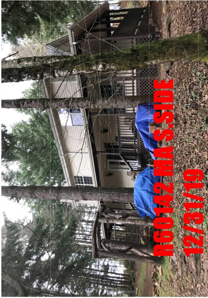
R60142 MA S. SIDE 12/31/19