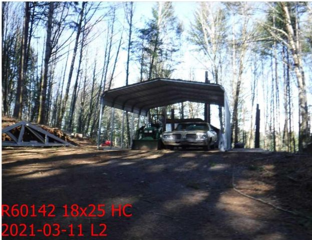
R60142 18x25 HC 2021-03-11 L2