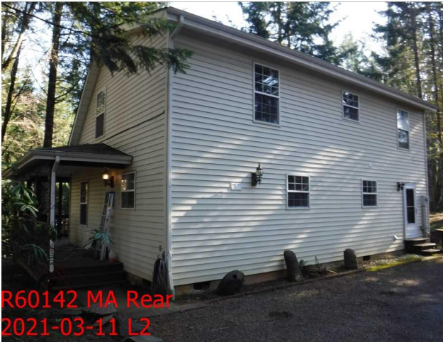
R60142 MA Rear 2021-03-11 L2