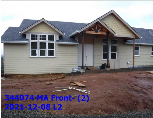
344074 MA Front- (2) 2021-12-08 L2