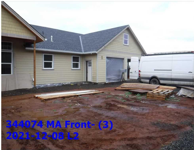
344074 MA Front- (3) 2021-12-08 L2