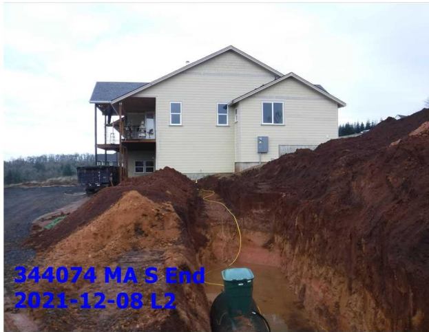
344074 MA S End 2021-12-08 L2