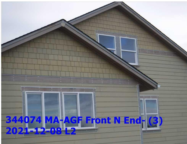
344074 MA-AGF Front N End- (3) 2021-12-08 L2