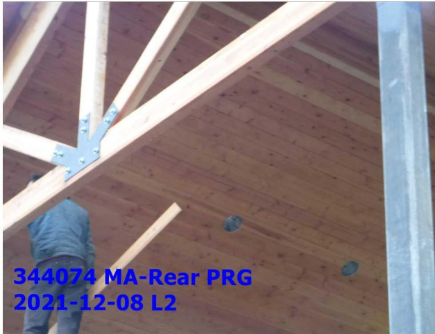
344074 MA-Rear PRG 2021-12-08 L2