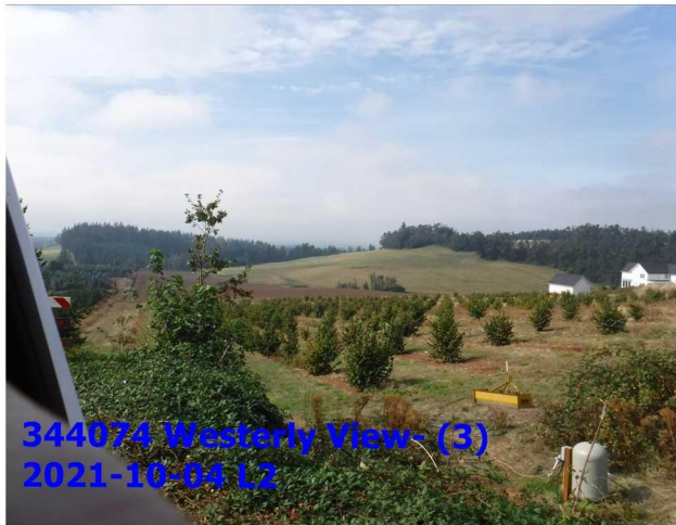
344074 Westerly View- (3) 2021-10-04 L2