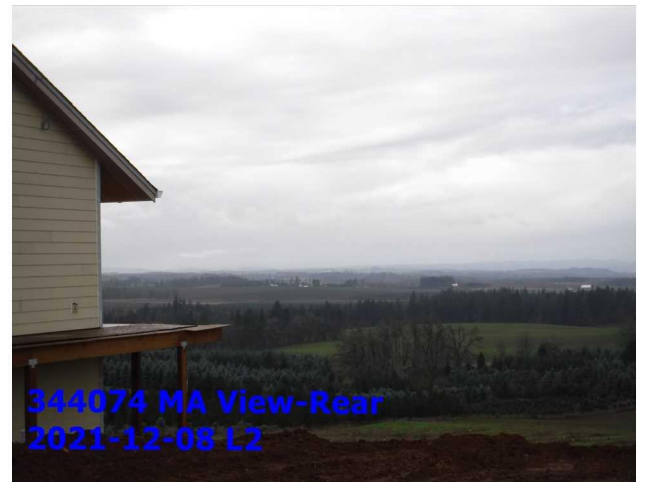
344074 MA View-Rear 2021-12-08 L2