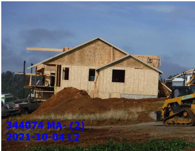
344074 MA- (2) 2021-10-04 L2