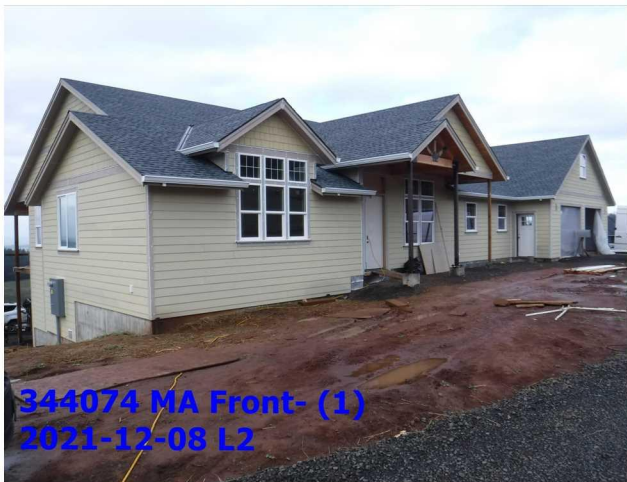
344074 MA Front- (1) 2021-12-08 L2