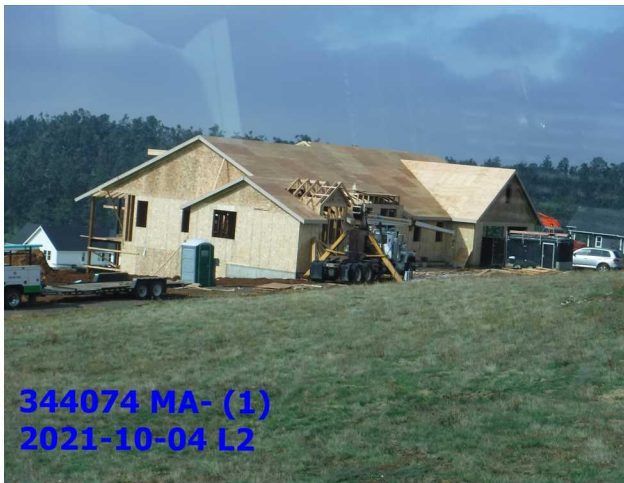
344074 MA- (1) 2021-10-04 L2