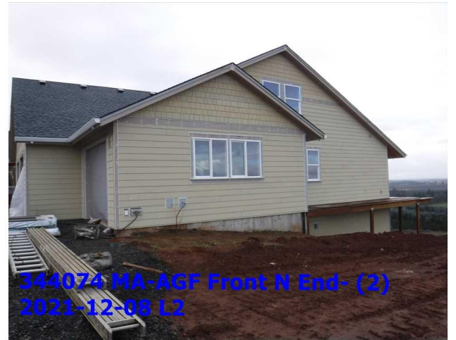
344074 MA-AGF Front N End- (2) 2021-12-08 L2