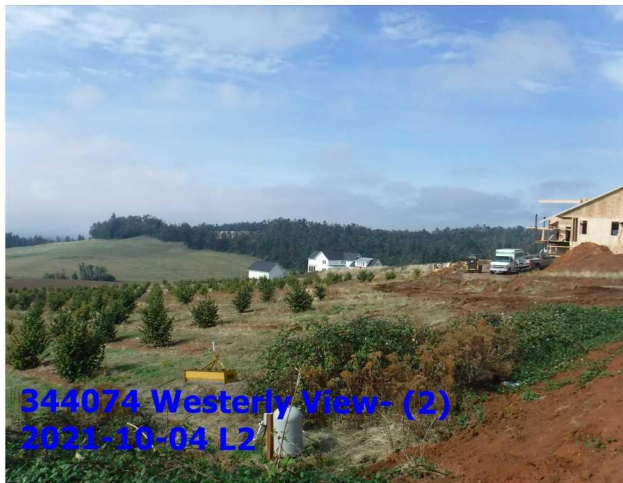
344074 Westerly View- (2) 2021-10-04 L2