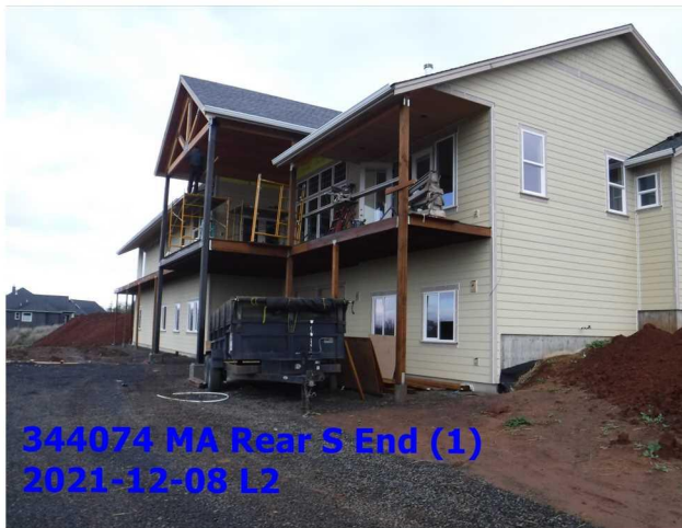
344074 MA Rear S End (1) 2021-12-08 L2