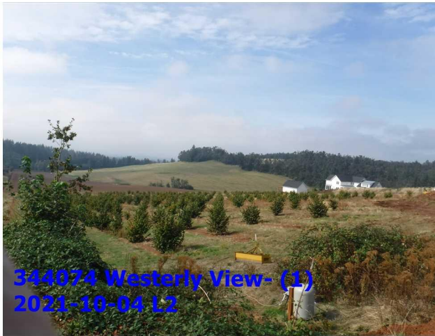
344074 Westerly View- (1) 2021-10-04 L2