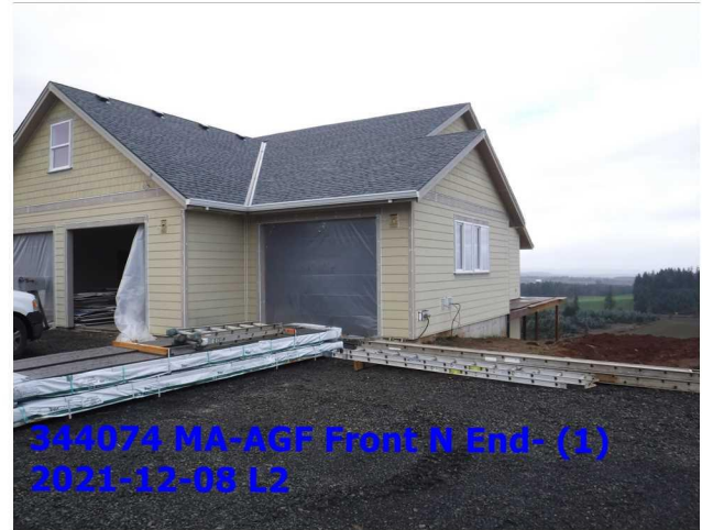
344074 MA-AGF Front N End- (1) 2021-12-08 L2