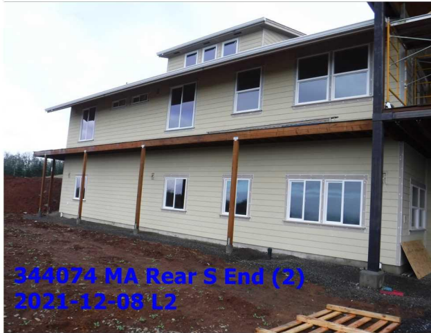
344074 MA Rear S End (2) 2021-12-08 L2