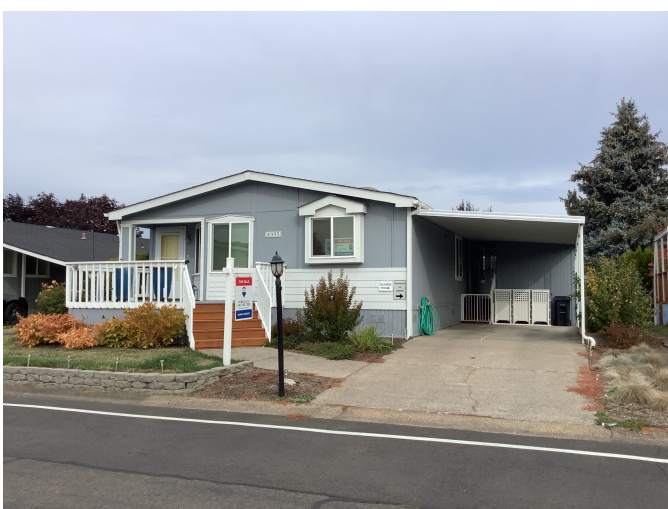
photo stg lights win

No improvement data available for all other stat class types.