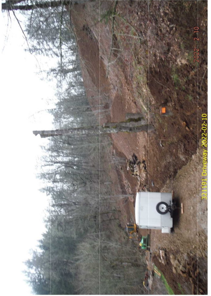
321191 Driveway 2022-02-10