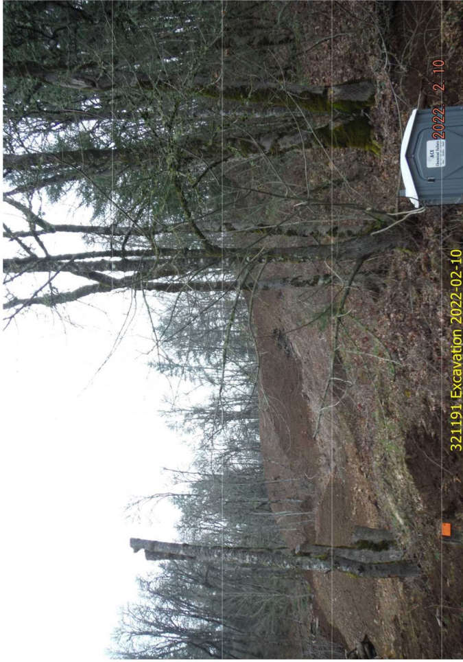
321191 Excavation 2022-02-10