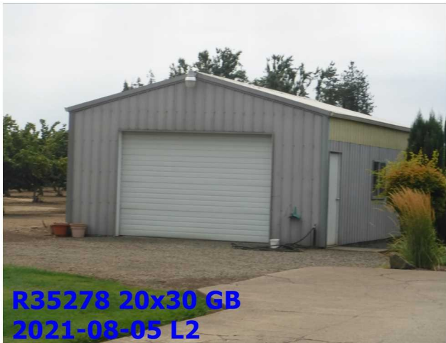
R35278 20x30 GB 2021-08-05 L2