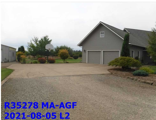
R35278 MA-AGF 2021-08-05 L2