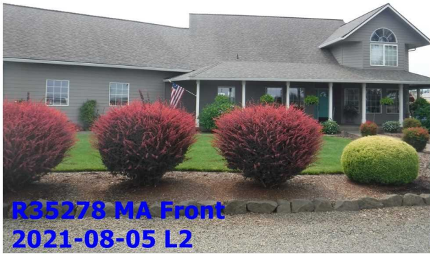
R35278 MA Front 2021-08-05 L2