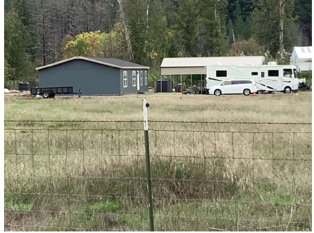
Manuf Front 10/2/23