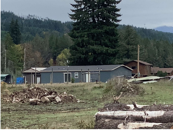
Manuf Rear 10/2/23