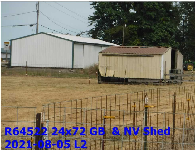
R64522 24x72 GB & NV Shed 2021-08-05 L2