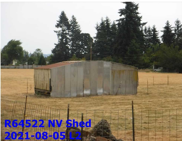
R64522 NV Shed 2021-08-05 L2