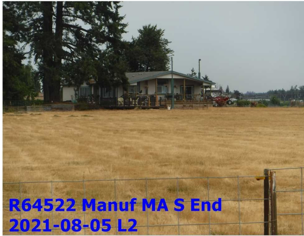
R64522 Manuf MA S End 2021-08-05 L2