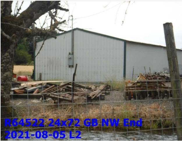
R64522 24x72 GB NW End 2021-08-05 L2