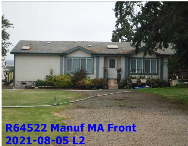
R64522 Manuf MA Front 2021-08-05 L2