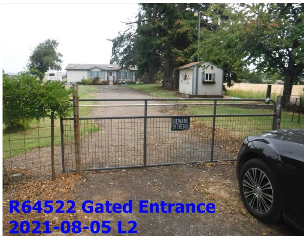
R64522 Gated Entrance 2021-08-05 L2