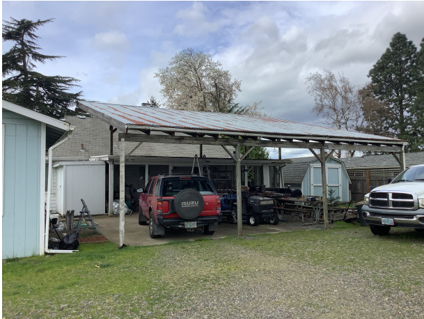
HC BACK MA