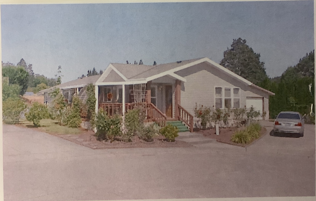
M132315 Terrace Lake (115) 8-04-08