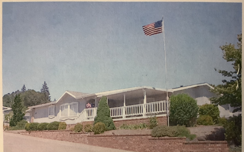
M131707 Terrace Lake (52) 7-31-08