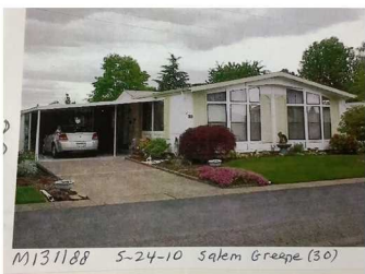
M131188 5-24-10 Salem Greape (30)