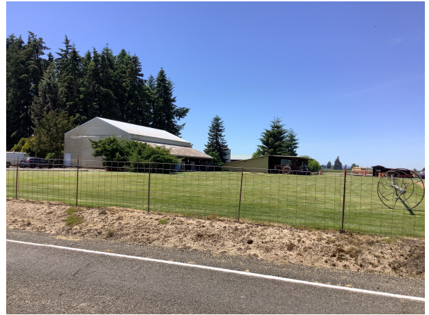
UB MS 05.31.24