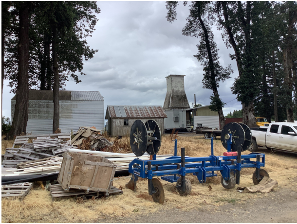
GB MP MS