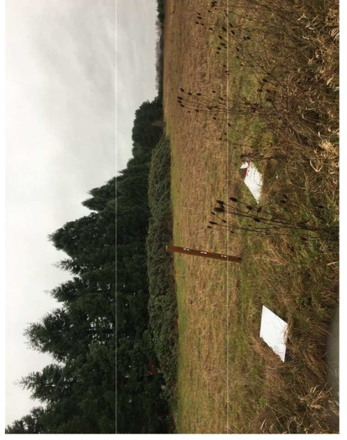
R330473 B. berries, grass, trees NE side 01/13/2020