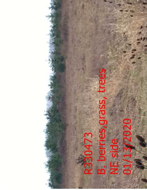
R330473 B. berries, grass, trees NE side 01/13/2020