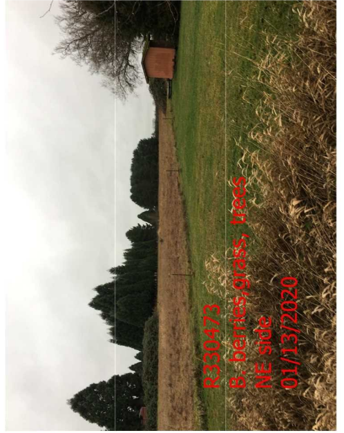
R330473 B. berries, grass, trees NE side 01/13/2020