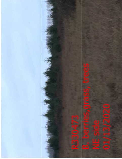
R330473 B. berries, grass, trees NE side 01/13/2020