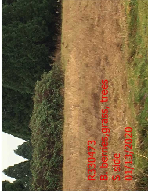
R330473 B. berries, grass, trees S side 01/13/2020