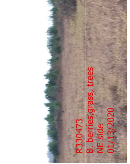
R330473 B. berries, grass, trees NE side 01/13/2020