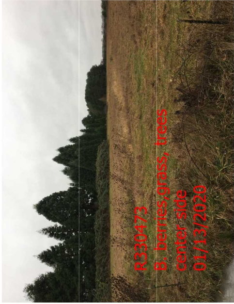
R330473 B. berries, grass, trees center side 01/13/2020