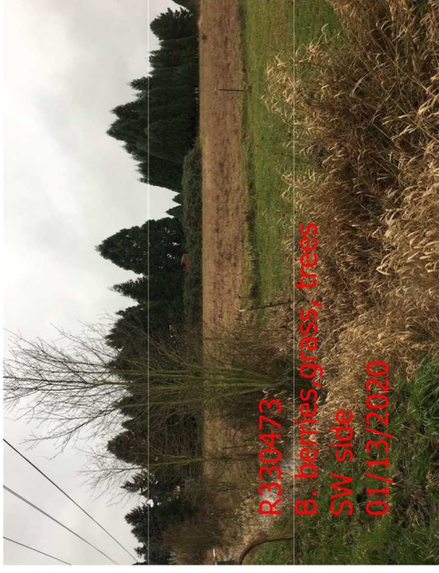
R330473 B. berries, grass, trees SW side 01/13/2020