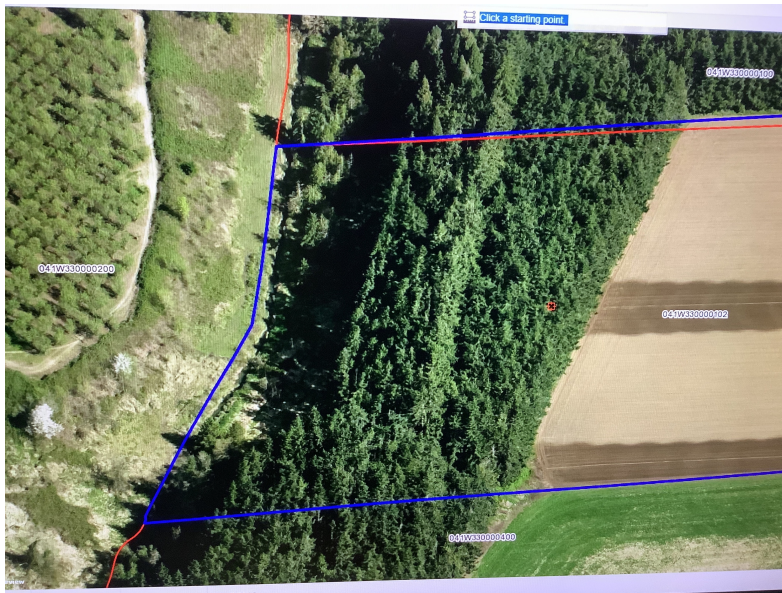
Woodlot AERIAL 4.27.23 L4