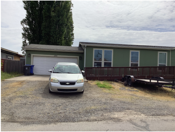
AGF MH 05.24.24