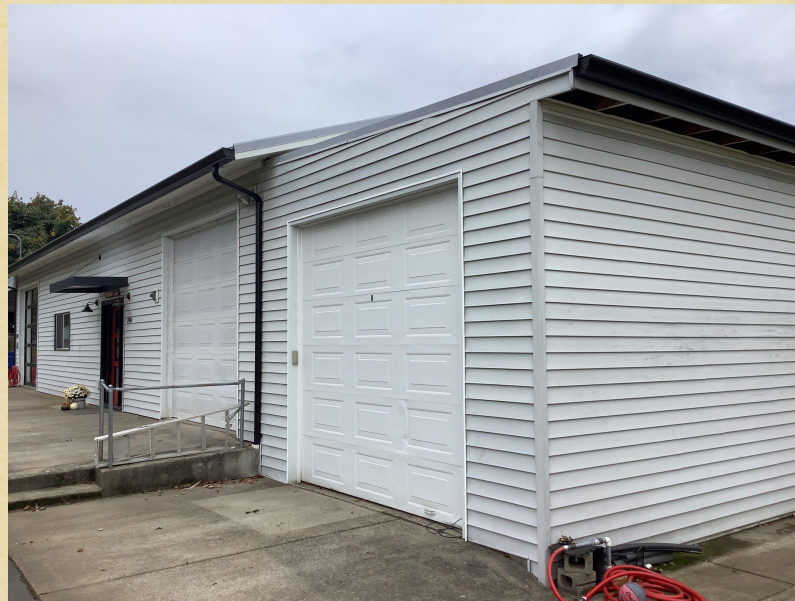
AGU MA-HARDSHIP 10.13.23 L2