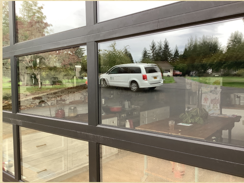
HARDSHIP INTERIOR 10.13.23 L2