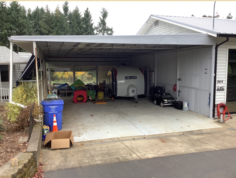
PA 10.13.23 L2