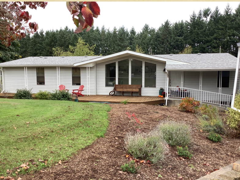
MH 10.13.23 L2