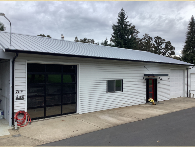
MA HARDSHIP 10.13.23 L2