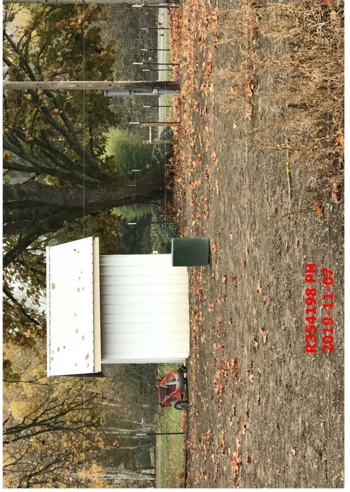
R354198 PH 2019-11-07