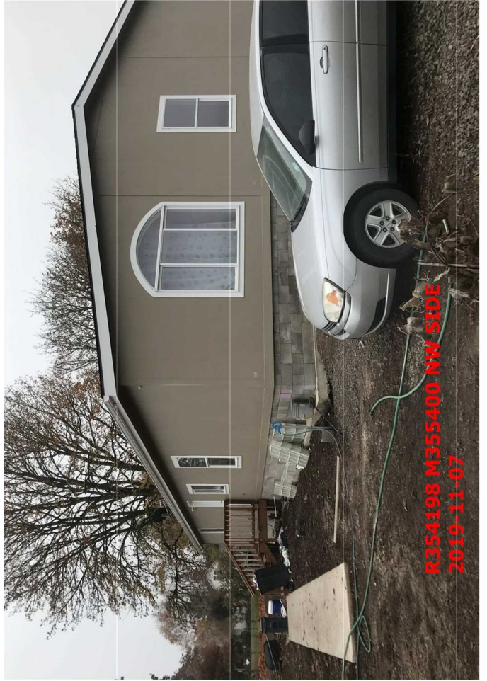
R354198 M355400 NW SIDE 2019-11-07