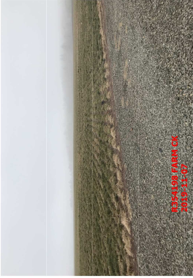
R354198 FARM CK 2019-11-07