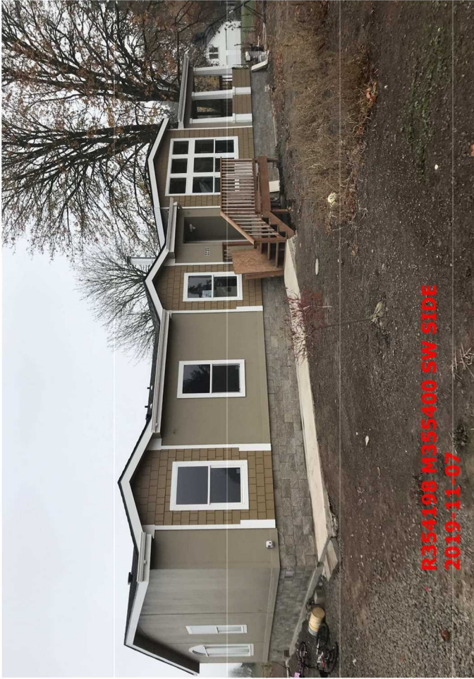
R354198 M355400 SW SIDE 2019-11-07