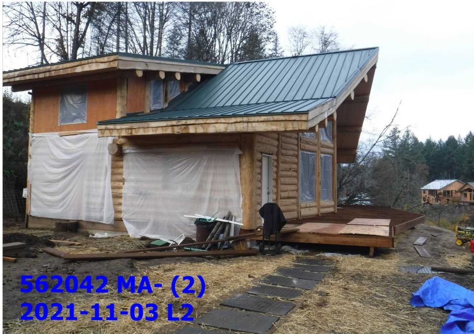
562042 MA- (2) 2021-11-03 L2