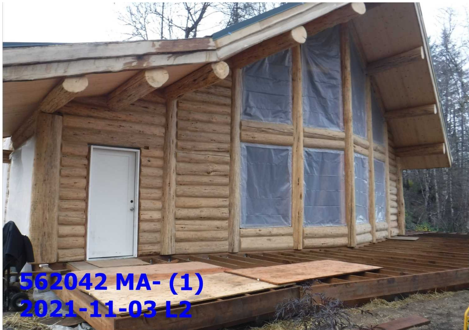
562042 MA- (1) 2021-11-03 L2