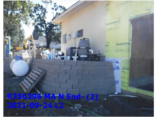
R356396 MA N End- (2) 2021-09-24 L2