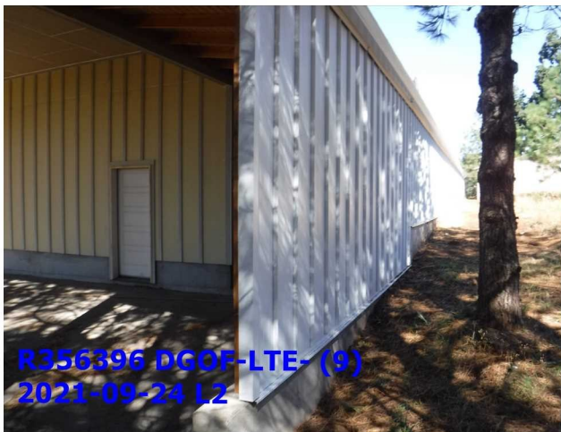
R356396 DGOF-LTE- (9) 2021-09-24 L2