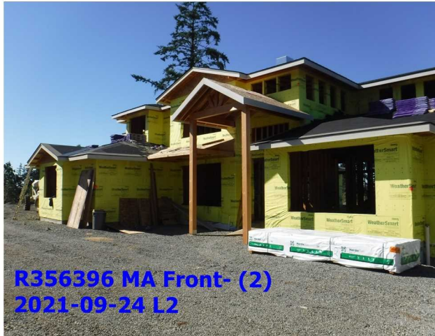
R356396 MA Front- (2) 2021-09-24 L2