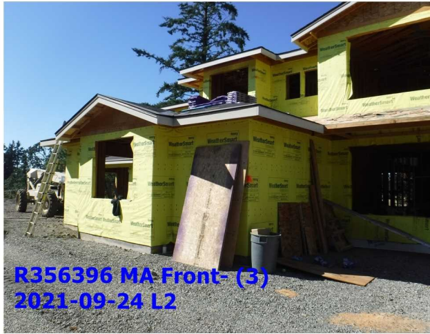
R356396 MA Front- (3) 2021-09-24 L2