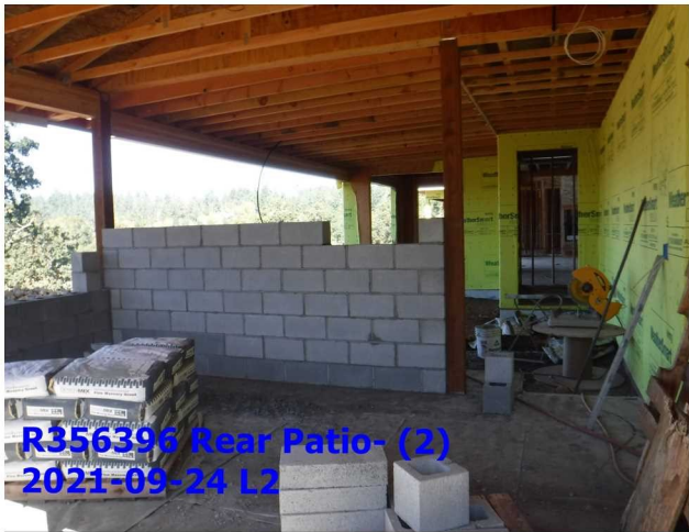
R356396 Rear Patio- (2) 2021-09-24 L2