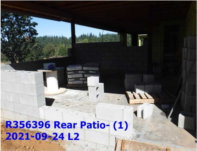
R356396 Rear Patio- (1) 2021-09-24 L2