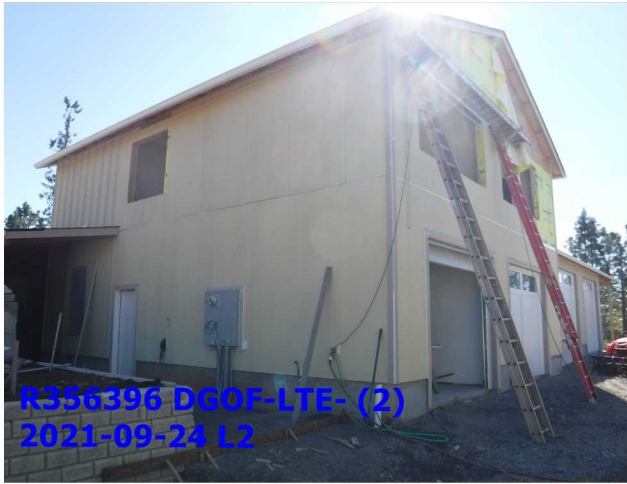
R356396 DGOF-LTE- (2) 2021-09-24 L2