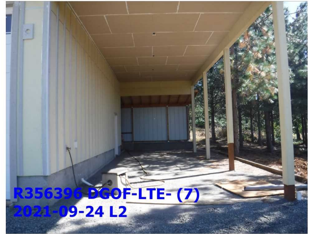
R356396 DGOF-LTE- (7) 2021-09-24 L2