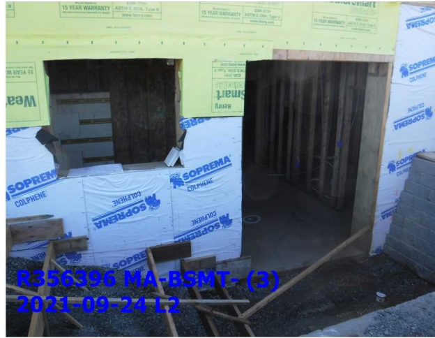
R356396 MA-BSMT- (3) 2021-09-24 L2