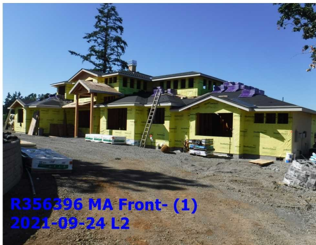
R356396 MA Front- (1) 2021-09-24 L2