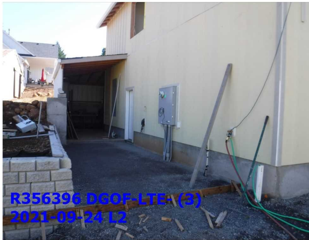
R356396 DGOF-LTE- (3) 2021-09-24 L2