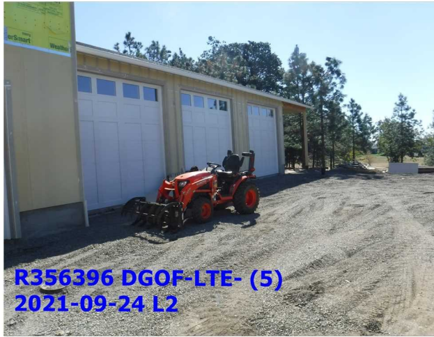
R356396 DGOF-LTE- (5) 2021-09-24 L2