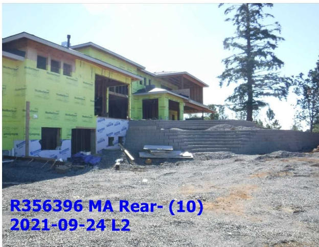
R356396 MA Rear- (10) 2021-09-24 L2