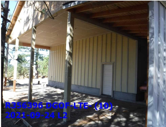
R356396 DGOF-LTE- (10) 2021-09-24 L2