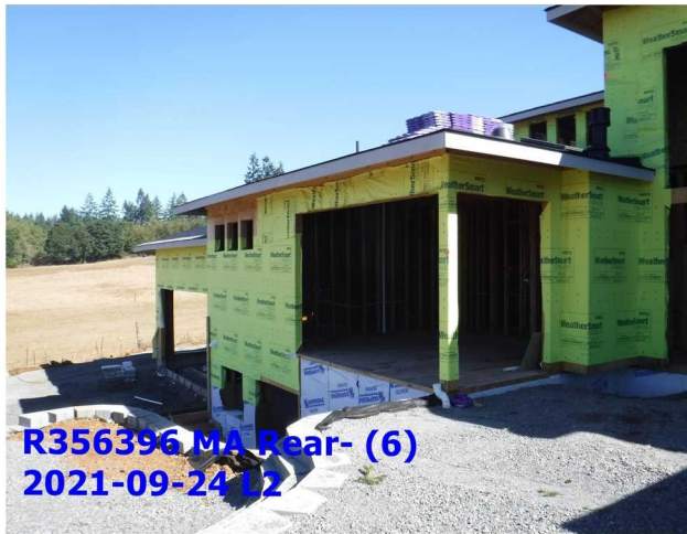
R356396 MA Rear- (6) 2021-09-24 L2