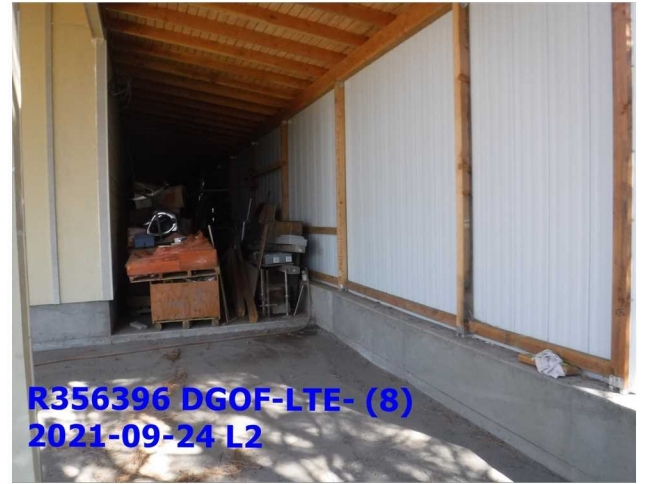
R356396 DGOF-LTE- (8) 2021-09-24 L2