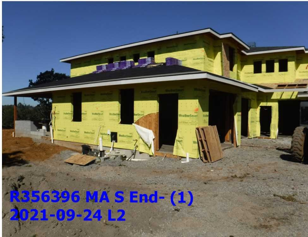
R356396 MA S End- (1) 2021-09-24 L2