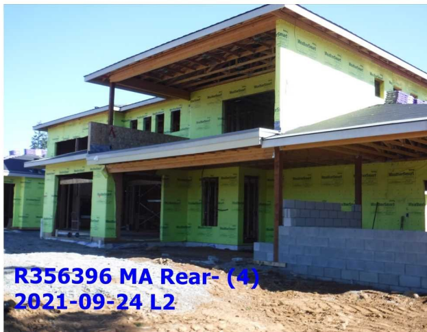
R356396 MA Rear- (4) 2021-09-24 L2