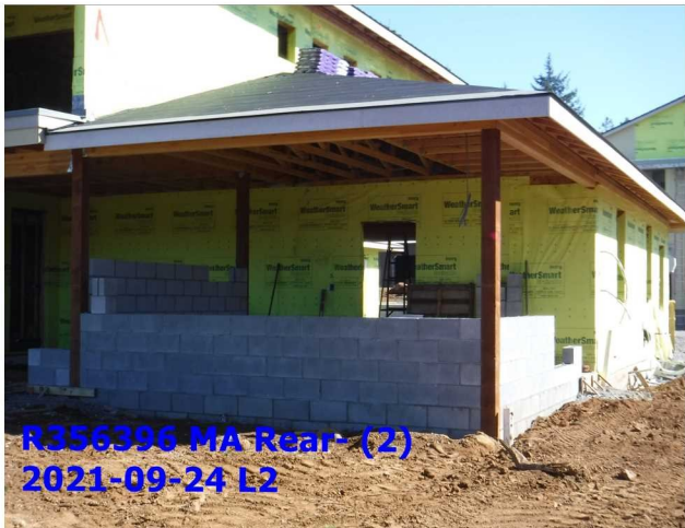
R356396 MA Rear- (2) 2021-09-24 L2