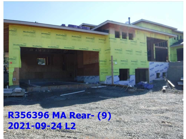
R356396 MA Rear- (9) 2021-09-24 L2