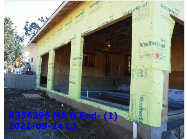
R356396 MA N End- (1) 2021-09-24 L2