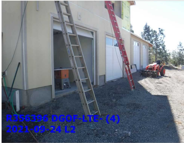
R356396 DGOF-LTE- (4) 2021-09-24 L2