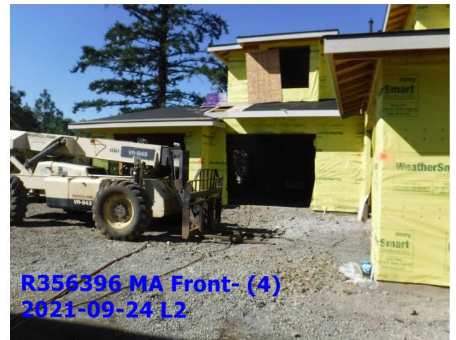
R356396 MA Front- (4) 2021-09-24 L2