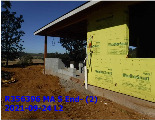
R356396 MA S End- (2) 2021-09-24 L2