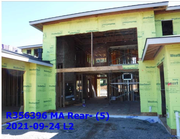
R356396 MA Rear- (5) 2021-09-24 L2