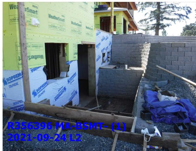
R356396 MA-BSMT- (1) 2021-09-24 L2