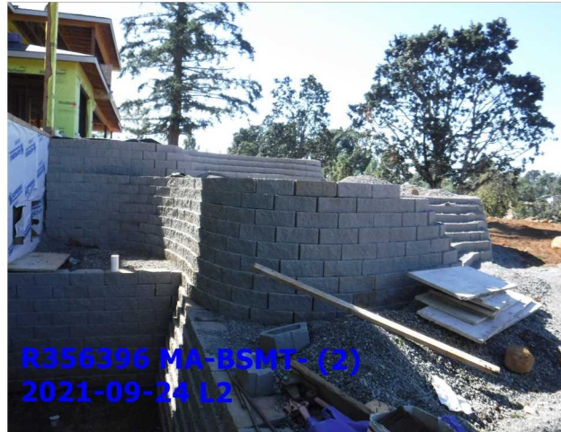
R356396 MA-BSMT- (2) 2021-09-24 L2