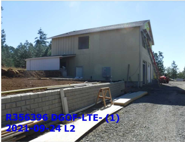
R356396 DGOF-LTE- (1) 2021-09-24 L2