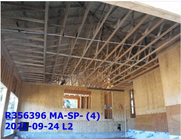
R356396 MA-SP- (4) 2021-09-24 L2