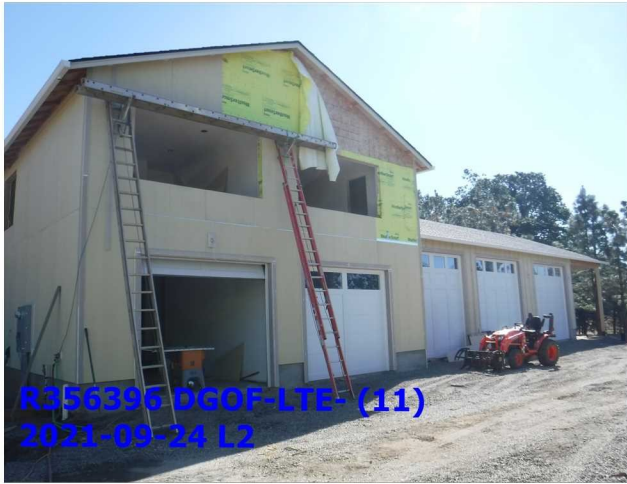
R356396 DGOF-LTE- (11) 2021-09-24 L2