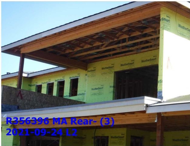
R356396 MA Rear- (3) 2021-09-24 L2