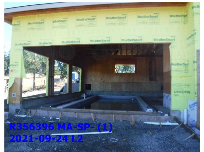
R356396 MA-SP- (1) 2021-09-24 L2