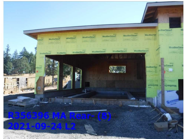
R356396 MA Rear- (8) 2021-09-24 L2