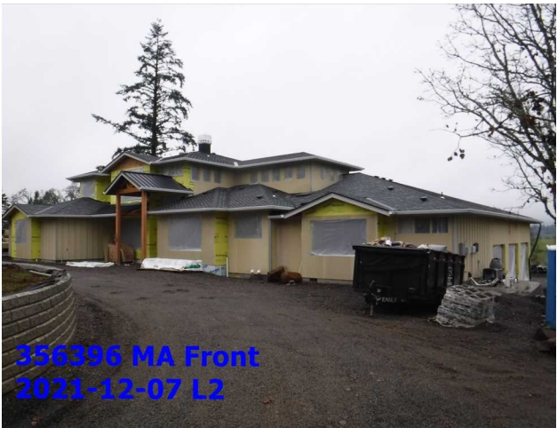
356396 MA Front 2021-12-07 L2