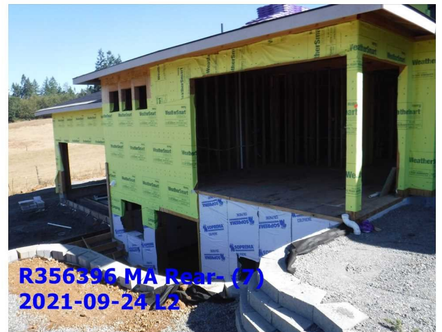
R356396 MA Rear- (7) 2021-09-24 L2