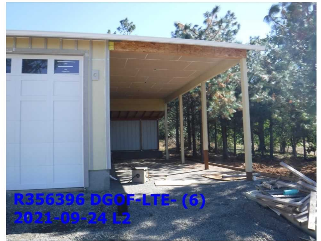
R356396 DGOF-LTE- (6) 2021-09-24 L2