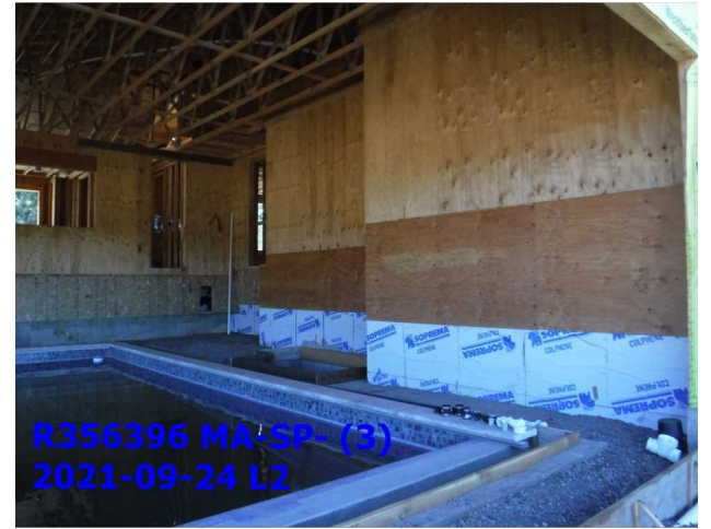
R356396 MA-SP- (3) 2021-09-24 L2