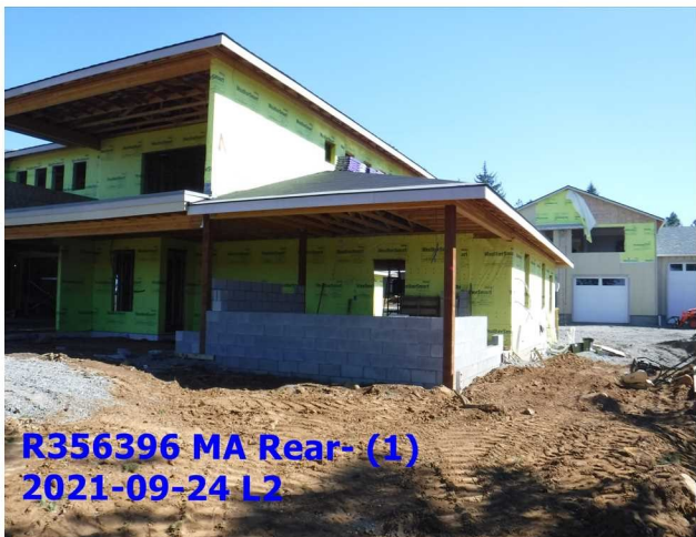
R356396 MA Rear- (1) 2021-09-24 L2