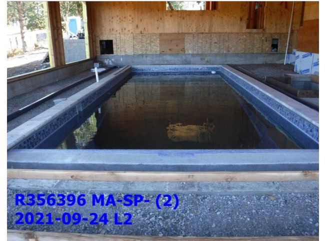
R356396 MA-SP- (2) 2021-09-24 L2