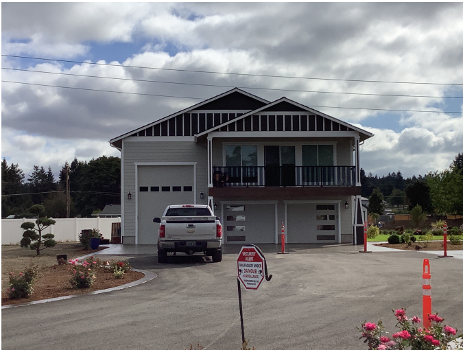
DGOF DGAF 09.13.23