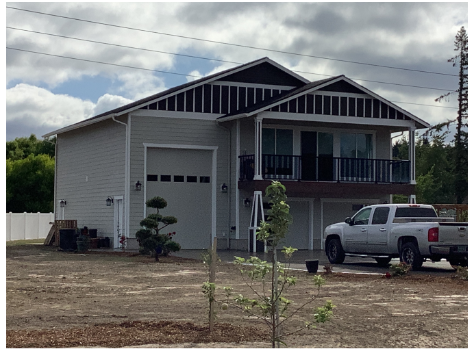
REAR DGOF DGAF 09.13.23